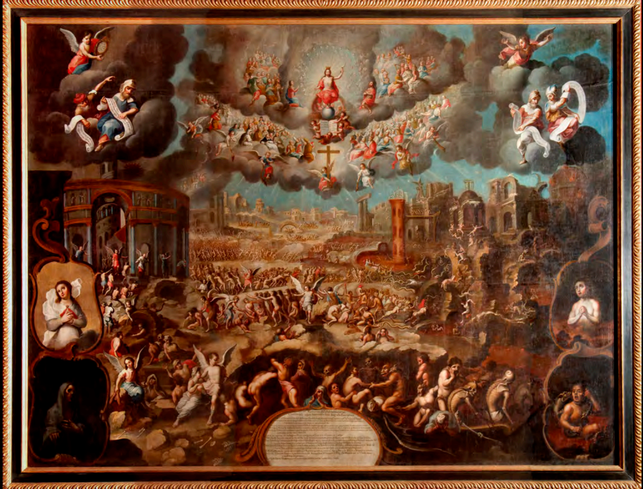
Juicio Final (Last Judgment) , about 1790